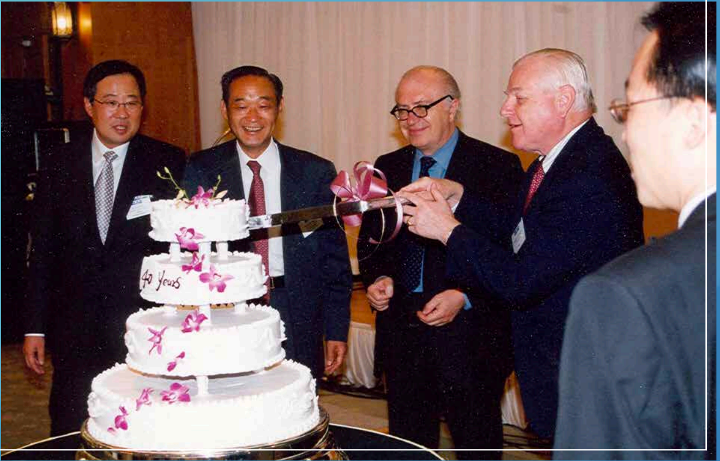
40th Anniversary Commemoration of BIAC (2002)