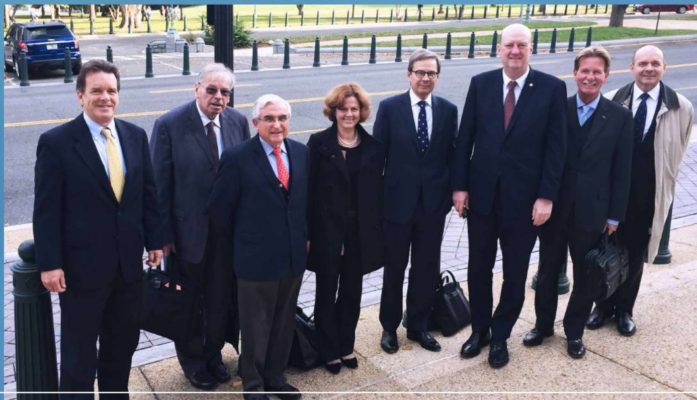
Board Meeting, Washington, D.C. (2017)