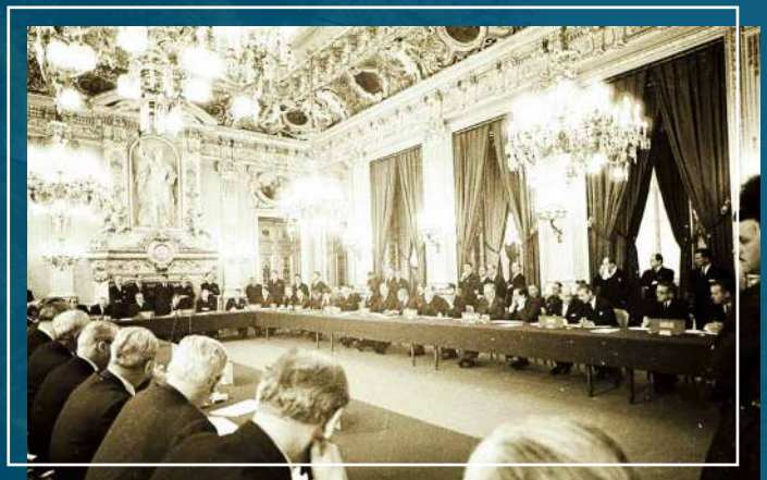
Signing of the OECD Convention at Quai d'Orsay, Paris (1960)

In addition to its 38 member countries, the Organization also has close relations with key partners including Brazil, China, India, Indonesia, and South Africa. By leveraging the relationships with key partners, the OECD gathers around its table a group of countries that account for 80% of world trade and investment, giving it a pivotal role in addressing the challenges the world economy faces.