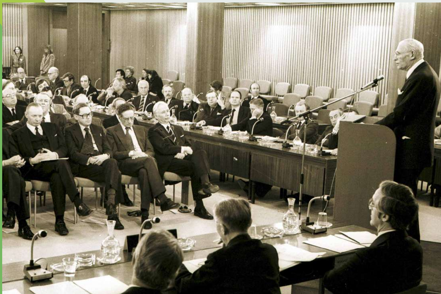
Dr. Marcus Wallenberg, first chair and founder of BIAC, reflecting on 20 years of business partnership with OECD and discussing priorities for the future at a meeting commemorating 20 years of BIAC (March 1982)