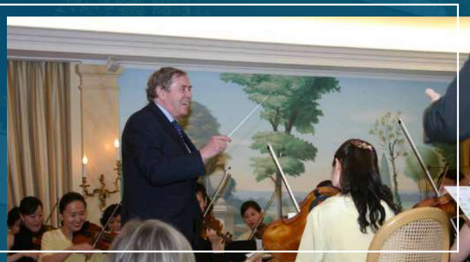
Former OECD Secretary-General Donald Johnston at BIAC dinner

We cannot talk about the development of the OECD without referring to the leadership of US Secretary of State General George Marshall, who enabled European economic reconstruction thanks to American aid under the European Recovery Program, better known as the Marshall Plan. In 1948, countries established the Organization for European Economic Co-operation (OEEC), a precursor to the OECD, to help administer the Plan.