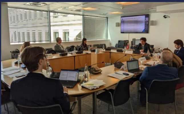
(Business at OECD Food and Agriculture Committee Meeting April 2022)