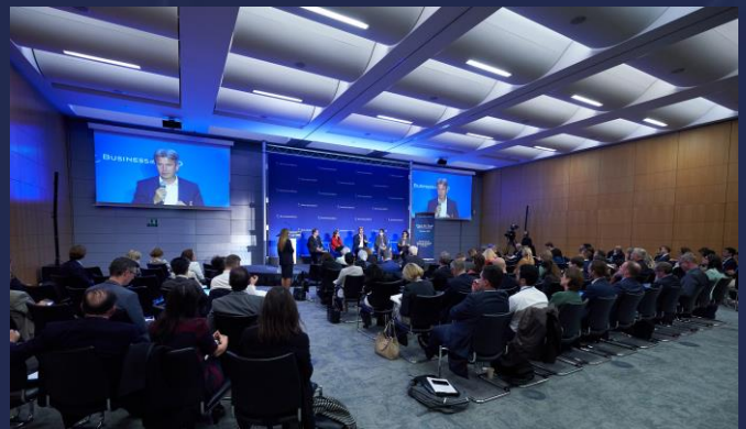
(Peace for Food High Level Roundtable)

This solution-focused dialogue explored actions that could be taken by the private and public sectors, and brought multiple OECD Ambassadors, representatives from OECD Governments, World Bank and Academia together, among others.