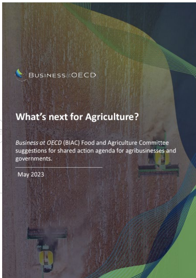
What's Next for Agriculture? (May 2023)