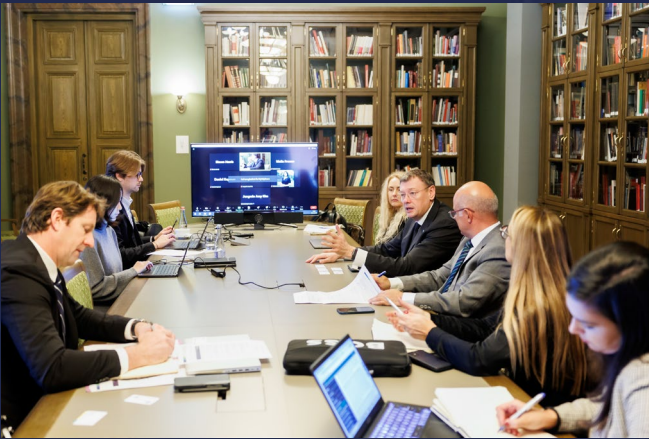
(Business at OECD Food and Agriculture Committee Meeting November 2023)