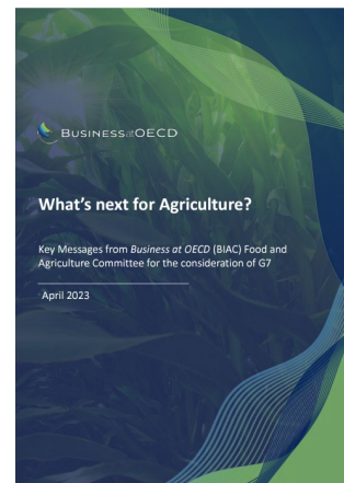
Key messages for the consideration of G7 (April 2023)

This "What's Next for Agriculture" insights report prepared by Business at OECD builds upon our previous contributions and explores further the practical actions that can be undertaken to enable more sustainable, productive and resilient food systems. Taking stock of the current situation in agriculture markets and the outcomes of the AGMIN, our report provides for a shared action agenda for agribusinesses and governments.