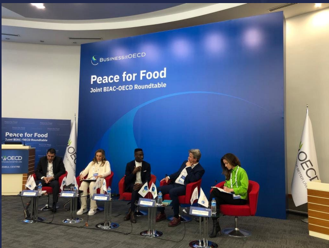
(Joint Business at OECD (BIAC) – OECD Istanbul Centre Roundtable)

In May, together with the OECD Istanbul Centre, and as the next step of our Peace For Food campaign, we brought global stakeholders together to Istanbul for our Roundtable on Opportunities to promote more sustainable, productive and resilient food systems . The event was the first official event of the OECD Istanbul Centre since its launch in March 2023, and took place in the context of the renewal of the Grain Corridor Agreement.