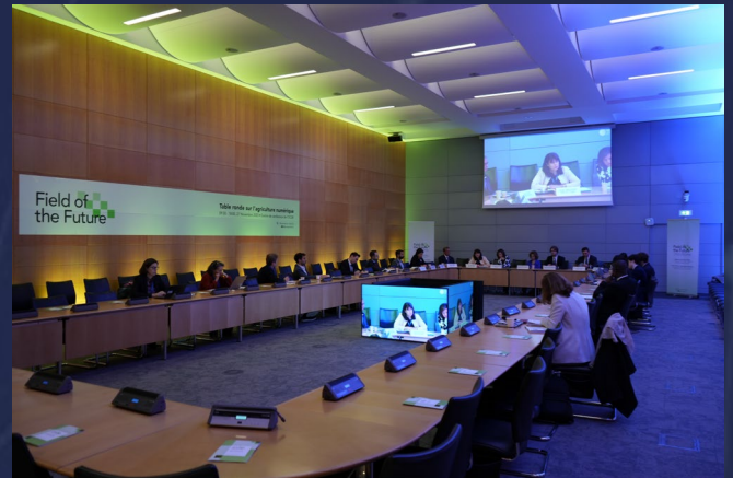
(Field of the Future – Digital Farming Roundtable)

On 27 November, we launched our new, Field of the Future campaign through the organization of a digital farming roundtable in Paris. Representatives from various sectors within the agricultural and digital industries and government stakeholders exchanged promises and opportunities within the digital transformation of agriculture, contributing also to solving climate change challenges, and exploring the role that international collaboration can play in propelling such recommendations.