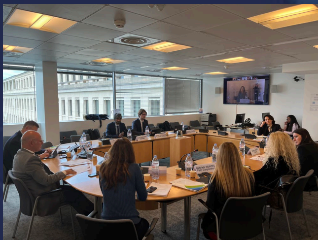
( Business at OECD Food and Agriculture Committee Meeting April 2023 )