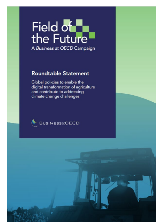
Field of the Future Roundtable Statement (January 2024)