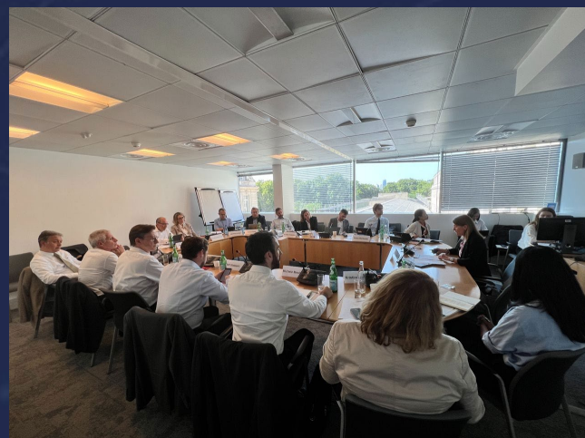
(Business at OECD Health Committee meeting in June 2023)