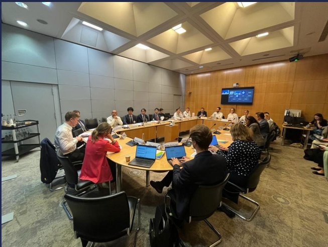
(Business at OECD Health Committee meeting in October 2023)