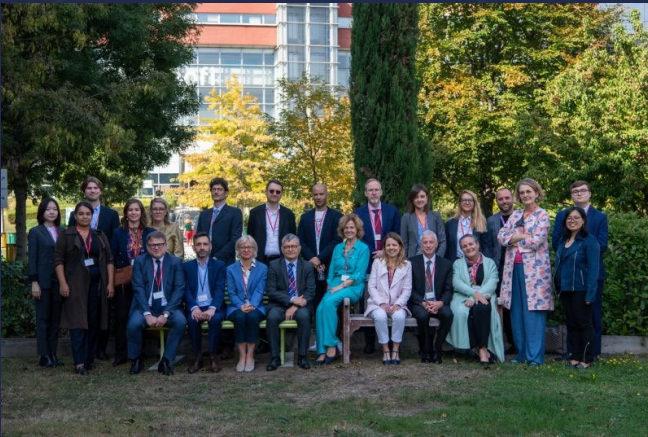
(Visit of Sanofi Industrial R&D Plant in Vitry-sur-Seine, October 2023)

After the Forum, we invited OECD Ambassadors and health officials for a Sanofi Industrial R&D Plant Visit in Vitry-sur-Seine, to continue the discussion on innovation and decarbonization in the health sector at an industrial site.