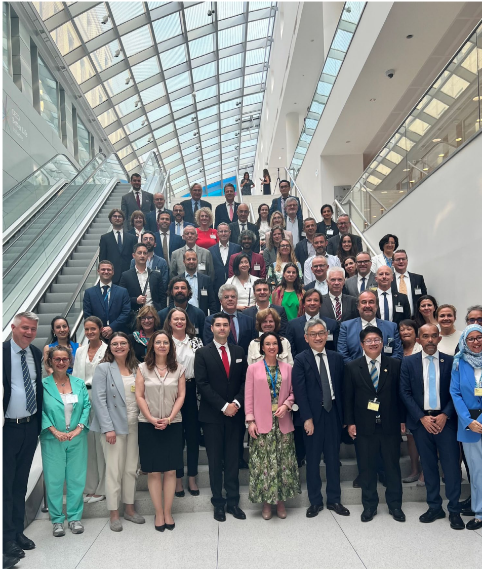
(Participants from our Ministerial Stakeholder Event with the OECD in June 2023)

Suasor Commercial Consultants (Australia)